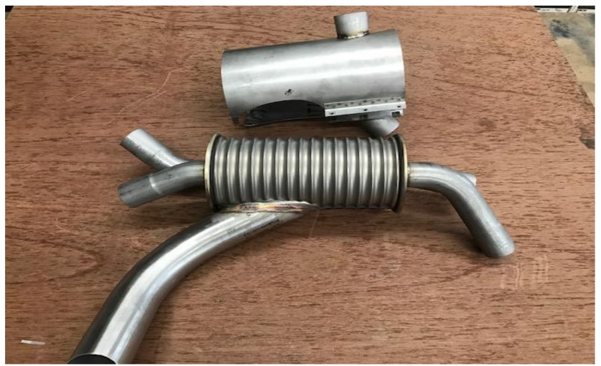
Figure 7: muffler with shroud removed