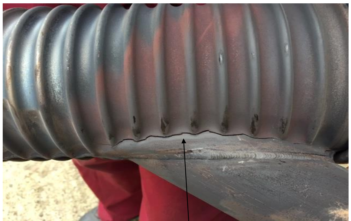
Figure 10, muffler crack