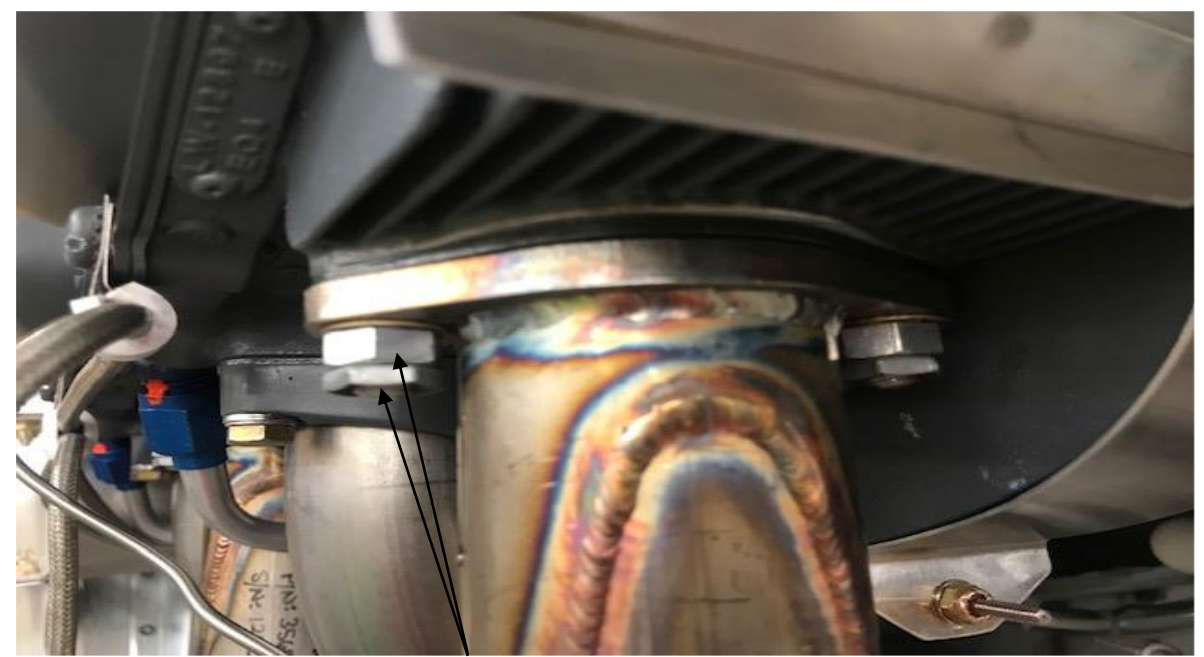
Figure 11, plain nut, and pal nut

Step 14. After installing the exhaust, torquing the nuts, and installing the EGT probes, the lower engine cowling can be installed in the reverse order as removed. Verify all mounting hardware is tightened and close the cowl doors.