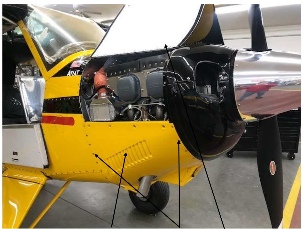
Figure 1: lower cowling, mounting screws, and cowl doors

Step 3. Remove the lower cowl assembly shown in Figure 1. To remove the lower cowling, start by opening the cowl doors and securing them out of the way as shown in figure 1.