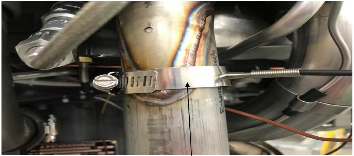
Figure 4, EGT probe

Step 5. Remove the EGT probe or probes from the exhaust manifold tube on number 3 cylinder, see Figure 4. Depending on aircraft options, all four exhaust manifold tubes can have EGT probes installed. Tie up the EGT probes and wiring out of the way, for ease in removal of the exhaust system.