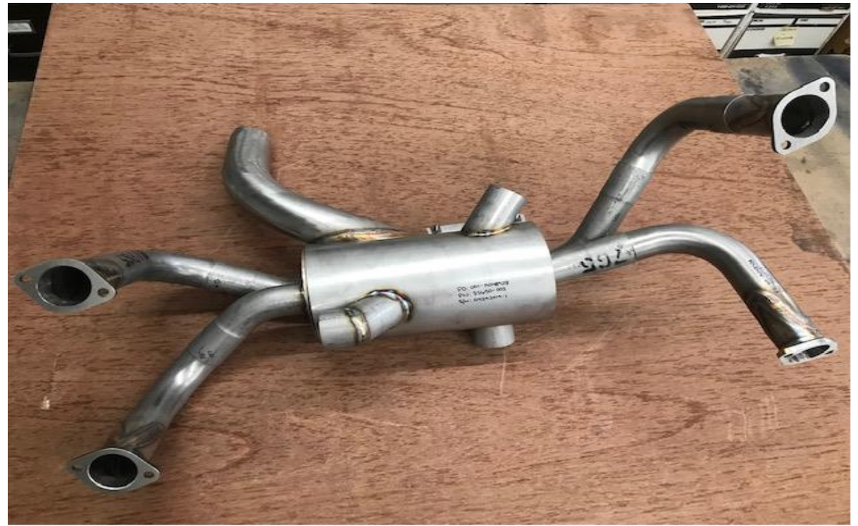
Figure 6: removed exhaust assembly

Step 7. Remove the exhaust assembly from the aircraft and place it on a bench for inspection as shown in Figure 6. Next, remove manifold tubes & shroud to expose the exhaust can as shown in Figure 7.