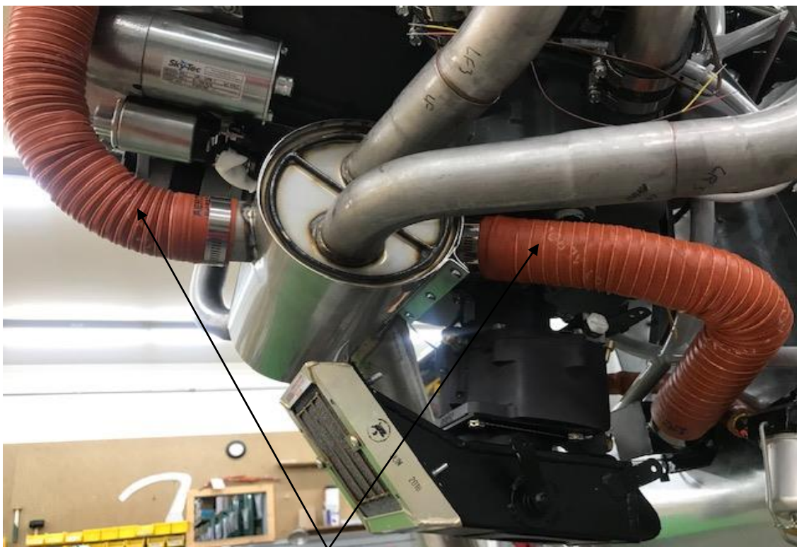
Figure 3, scat hoses

Step 4. Remove the exhaust system. With the lower cowling removed the exhaust system can be seen in Figure 2. To remove the exhaust system, start by locating and removing the two scat hoses attached to the exhaust as shown in Figure 3.