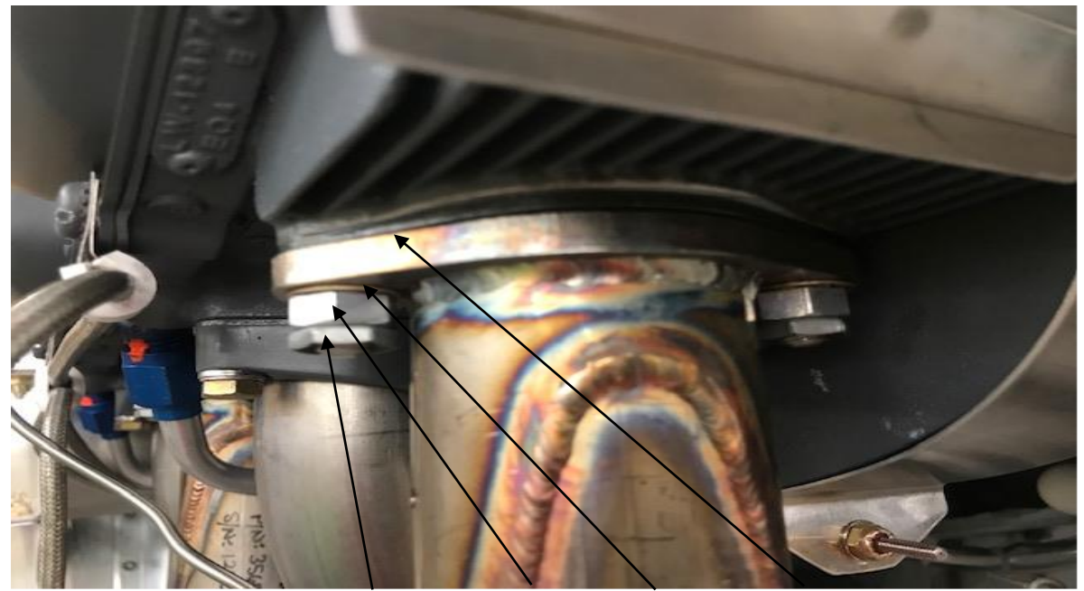
Figure 5, lock nuts, mounting nuts, washers, & exhaust gasket

Step 6. Remove the lock nuts from the 8 engine studs. Next remove the mounting nuts, two each, from each exhaust manifold tube (see Figure 5). The exhaust system should be held in place while the mounting nuts are being removed. Once the EGT probes and the mounting hardware are removed, the exhaust system can be removed by dropping it straight down with the manifold tubes still inserted on the muffler assembly. When the exhaust system is removed, discard the used exhaust gaskets.