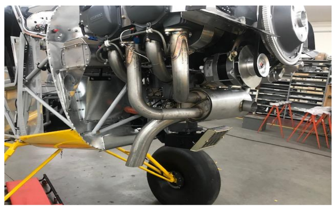
Figure 2: cowling removed

Step 4. Remove the exhaust system. With the lower cowling removed the exhaust system can be seen in Figure 2. To remove the exhaust system, start by locating and removing the two scat hoses attached to the exhaust as shown in Figure 3.