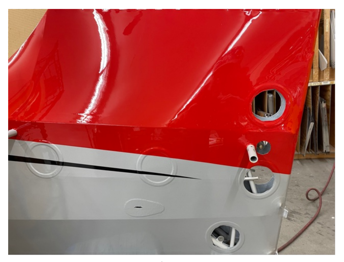
Figure 2, elevator, and stabilizer removed for clarity

Step 2. Remove the hole covers, remove two screws in each hole cover then move the hole cover forward to release the spring steel tab behind the fabric. With the hole covers removed, see figure 2, you will have access to the tubular structure of the fuselage.